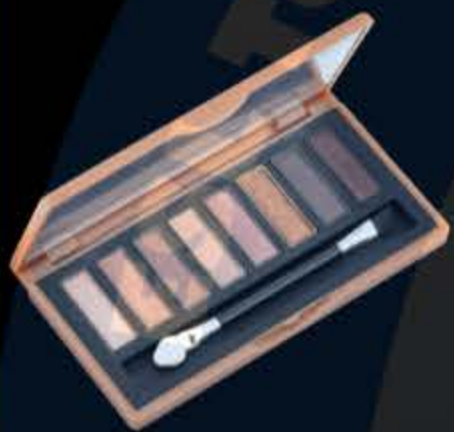
EYE SHADOW PALETTE